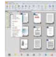
PaperPort SE 14

- The Professional Choice to Organize and Share Your Documents