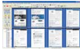
The AVScan X main screen

-The Intelligent Document Management Tool