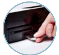
Scan to USB