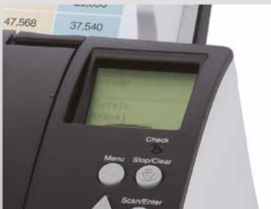
Integrated LCD operating panel

Scanner Central Admin software enable Fujitsu scanners to be managed and maintained from a single location to minimise scanner downtime anywhere on the global system.