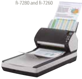
fi-7280 and fi-7260

fi-7160 / fi-7260 – A4 Portrait at 300 dpi 60 ppm / 120 ipm fi-7180 / fi-7280 – A4 Portrait at 300 dpi 80 ppm / 160 ipm Scan mixed batches through the 80 sheet ADF