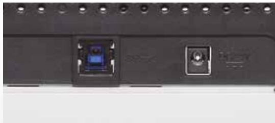
High speed performance through USB 3.0 interface

All four scanner models additionally make use of an ultrasonic sensor that accurately detects multifeed errors where two or more sheets are fed through the scanner at once plus the Intelligent Multifeed Function allows document scan parameters to be applied which enables the sensors to be set up to help identify and subsequently ignore attachments such as sticky notes or items with a photo attached that would otherwise cause disruptions to the scanning process.